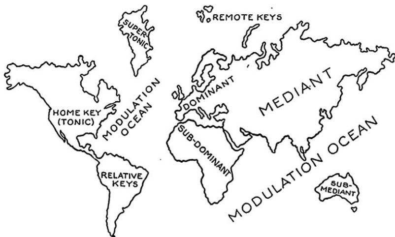
Map of a Sonata

From the Home Key, or Tonic, You Travel Abroad Across the Modulation Ocean to the Dominant. From the Dominant You Go by Airplane for a Fast Trip Around the Mediant, Sub-Mediant, or Even the Remote Keys Before Starting on the Homeward Journey