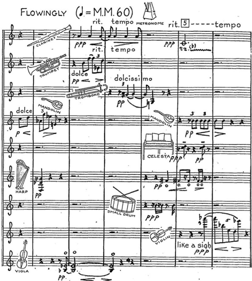
FIGURE 4. Webern, op. 10/4, as illustrated for “The Orchestral Score.” Christian Science Monitor , October 5, 1936. Pages Obtained From The Christian Science Monitor. All rights reserved. Used under license.