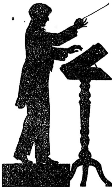
Nicolas Slonimsky Conducting an Orchestra During One of His European Trips

image of the conductor. After Stokowski's brilliant entrance at the outset of Fantasia , for example, Mickey Mouse fails to conduct his orchestra of broomsticks during the film's famous sequence set to Dukas's The Sorcerer's Apprentice . Mickey encounters a similar problem in The Band Concert (1935), in which Donald Duck repeatedly interrupts his performance of Rossini's William Tell Overture. Several Warner Bros. cartoons, including Rhapsody in Rivets (1941) and Baton Bunny (1959), likewise featured conductors as beleaguered protagonists. The former, which was nominated for Best Animated Short Film at the 1942 Academy Awards, features a canine conductor whose long white hair indicates a Stokowski parody.