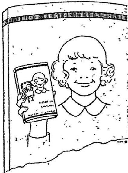
FIGURE 2. Illustration for “Shapes of Musical Pieces.” Christian Science Monitor , September 7, 1937.

A Musical Piece in Three Parts, Each One of Which Has Three Parts, Is Like the Cover of a Chocolate Bar Which Shows a Girl Holding a Chocolate Bar With a Cover Showing a Girl Holding a Tiny Chocolate Bar Showing a Girl Holding Such a Tiny Chocolate Bar That You Can Hardly See if the Girl on the Cover of That Very Tiny Chocolate Bar Is Holding a Microscopic Chocolate Bar With the Same Cover